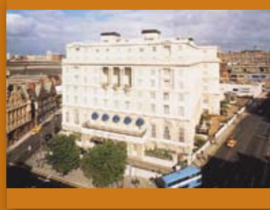
Adelphi Hotel, Liverpool

Authors wishing to have their abstract considered for inclusion in a specific award session must be a member of the BFS and should consult the eligibility criteria as listed on the website of the BFS: http://www.fertility.org.uk/ about/prizes.html